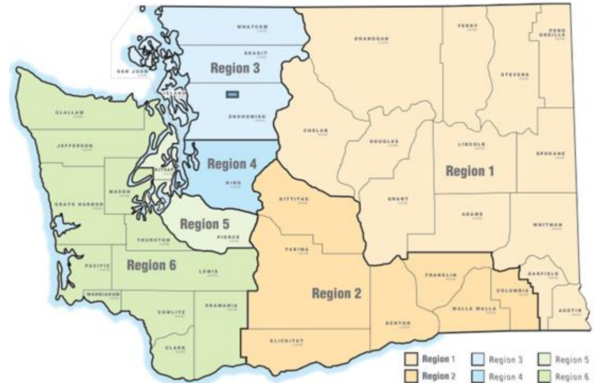
DCYF Region Map